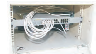
Base Compartment of 2052