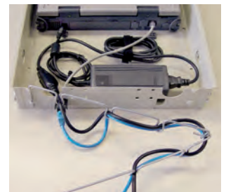
Articulating Cable Management System