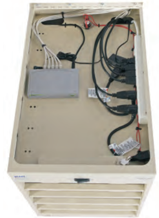
1652-L-10 Top view