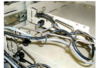
Network & AC Cabling to each Drawer