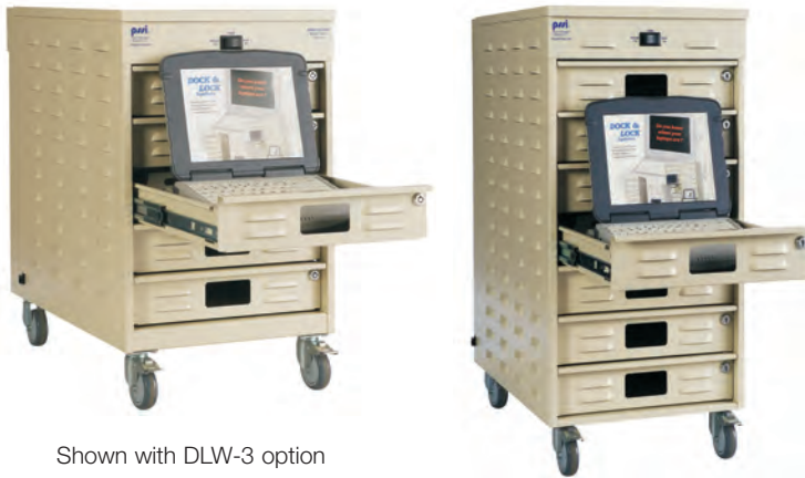
Shown with DLW-3 option

Model 2029-L-7 , a 7-drawer, 29" high cabinet, ideally fits under a counter top.