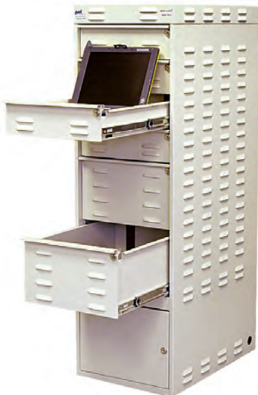
Model 1652-L Mixed Drawer Cabinet

PSSI will work with you to design a custom cabinet size, drawer size, combination of drawer sizes, cabinet color, cabling configuration, switch installation or other modifications to meet your specific needs.